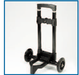
Detachable Wheeled Cart (306DS-626)