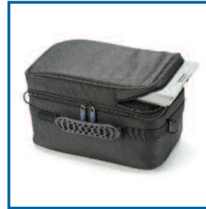
Accessory Bag (306DS-655)