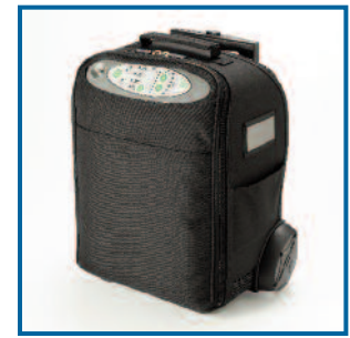
Deluxe Rolling Carry Case (306DS-635)