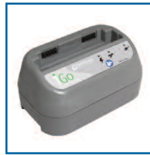
Battery Charger (306CH)